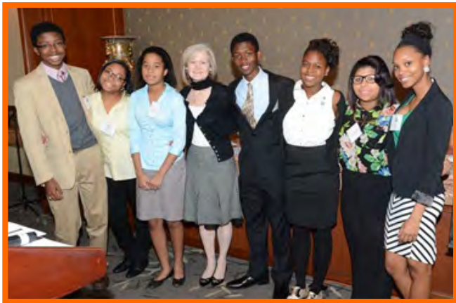
Young Adult Dale Carnegie Leadership Program Participants

In summer 2013, B.E.S.T. established a partnership with Dale Carnegie Training Mid-Atlantic, as they launched their Young Adult Dale Carnegie Leadership Program. Thirteen B.E.S.T. upper school students took part in the nine-session summer program designed to help them face challenges and embrace opportunities. Throughout the program, students stretched themselves to maximize their full potential while building the self-confidence necessary to seek leadership roles and responsibilities.