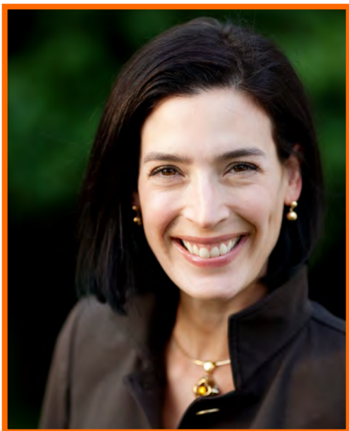
The Honorable Julie R. Rubin Judge Circuit Court for Baltimore City