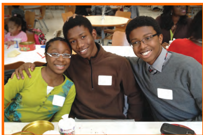
B.E.S.T. Family Holiday Party