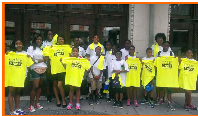
Summer Scholars at Camp Hippodrome