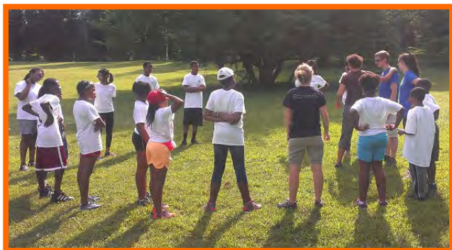
Summer Scholars Team Building Activity at Outward Bound