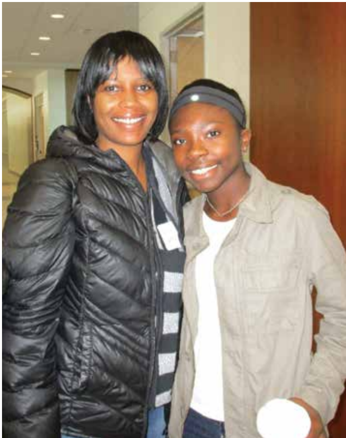
9 th Grade B.E.S.T. and Garrison Forest Student with her Mother at Towson University

The Towson University Admission Staff led an interactive, engaging and high-energy seminar that addressed the timeline of applying to college and gave the students year-by-year action items beginning in 9 th grade to maintain a path to a four-year college; defined commonly used college terms such as grants, GPA, transcript, financial aid; and highlighted the “return on investment” of obtaining a college degree, including lower unemployment rates and higher salaries.