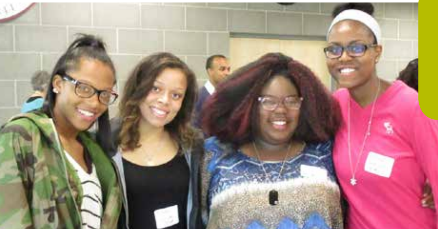
B.E.S.T. young women enjoying the Morning with Wes Moore