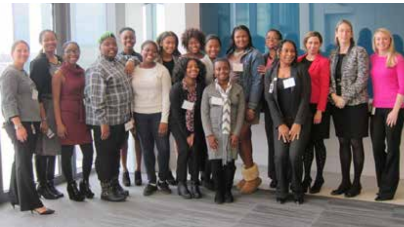
B.E.S.T. Students with Members of the Legg Mason Women's Leadership Network