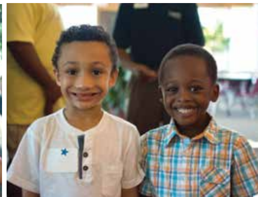
New B.E.S.T. students