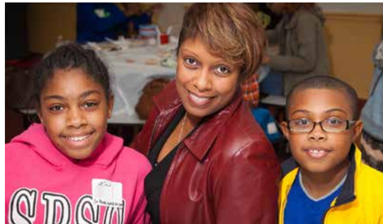
Mom with her two B.E.S.T. students enjoying the Holiday Party