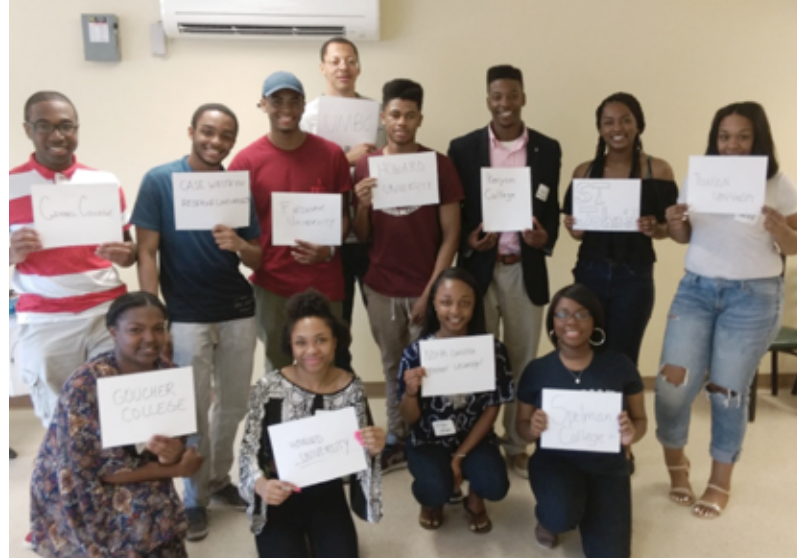
College-aged Alumni holding signs of where they attend college