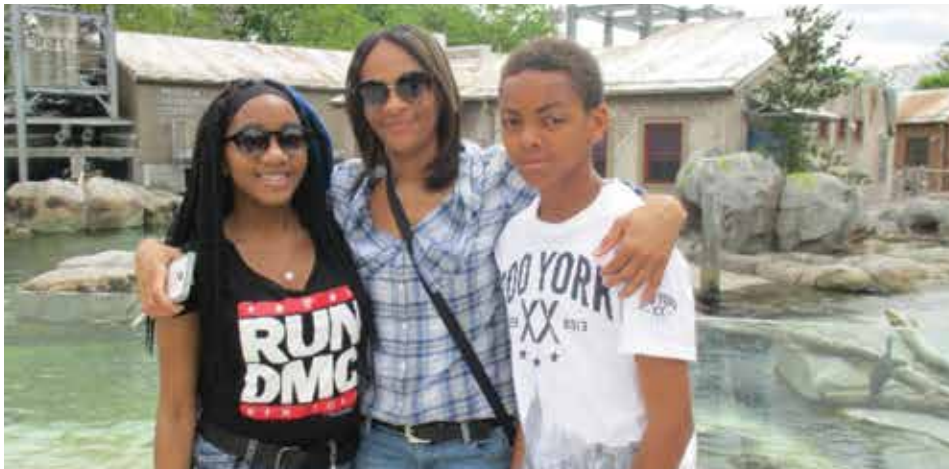
A B.E.S.T. family at the Maryland Zoo in Baltimore