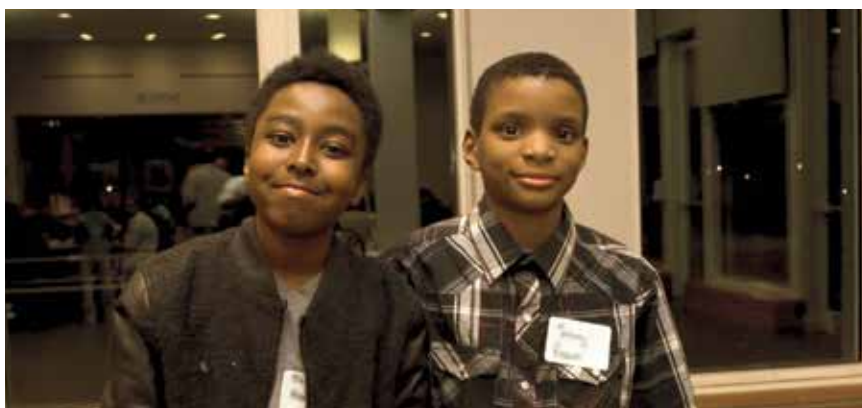
B.E.S.T. students from Boys' Latin School and Gilman School