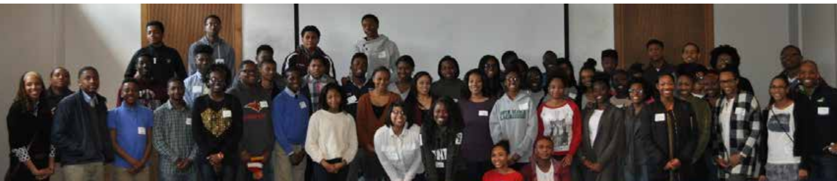
B.E.S.T. and GBALI upper school students with GBALI Directors