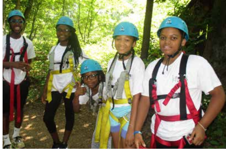
Happy Summer Scholars students conquer the ropes course at Outward Bound