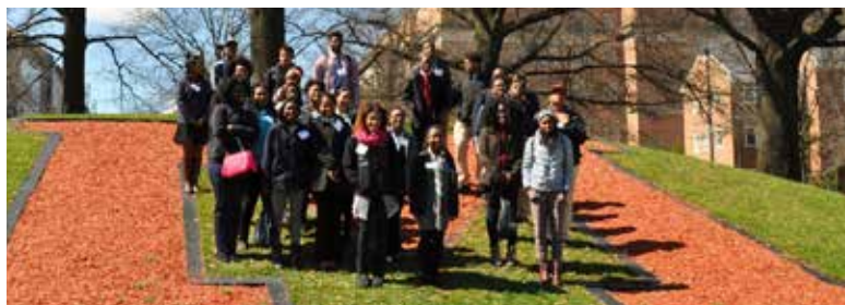
B.E.S.T. upper school students at University of Maryland, College Park