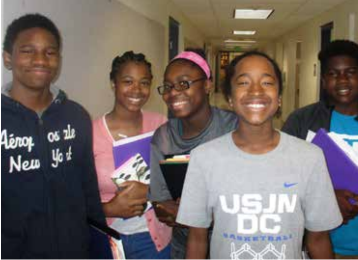
Upper school Summer Scholars students between classes