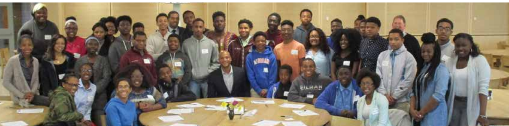
Wes Moore with B.E.S.T. and Boys' Latin upper school students