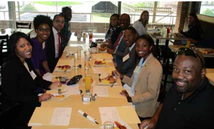
B.E.S.T. Alumni enjoying breakfast

We look forward to this Alumni event each year, and we thank our Alumni who share their talents to support the work of B.E.S.T.