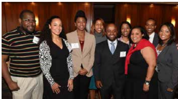
B.E.S.T. Alumni from Friends School of Baltimore, Garrison Forest School, Gilman School, McDonogh School, The Park School of Baltimore, and Roland Park Country School