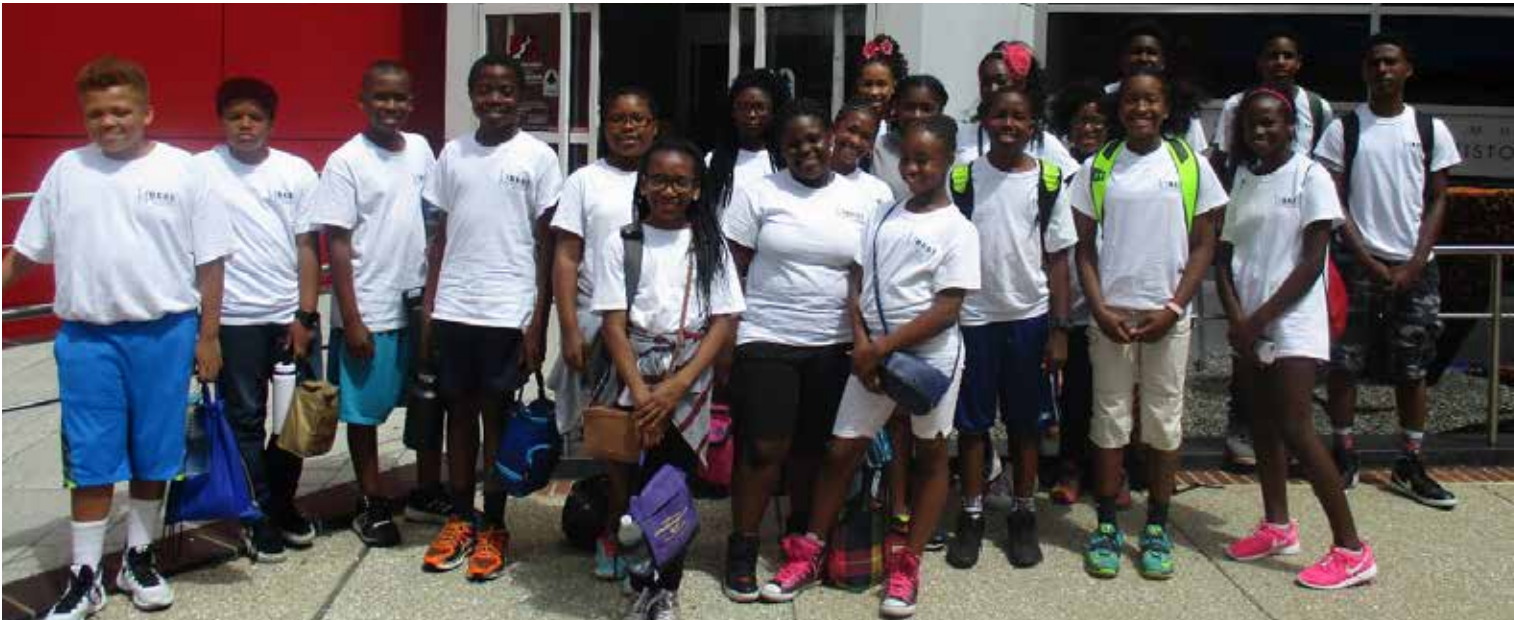
Summer Scholars students outside of the Reginald F. Lewis Museum