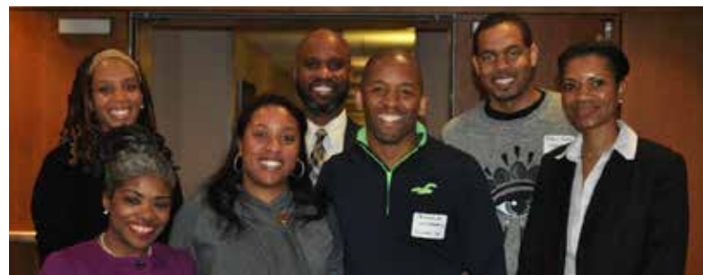
The Pope Institute for Polish, Poise, and Etiquette with Gilman Black Alumni Leadership Institute Directors

GBALI selected eleven B.E.S.T. students as part of their 2015-2016 academic year cohort of thirty-four students that met each Saturday, October through May.