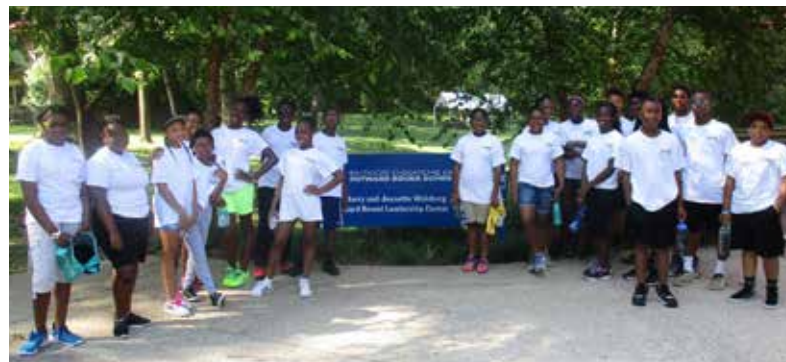
Summer Scholars students arrive at the Baltimore Chesapeake Bay Outward Bound School