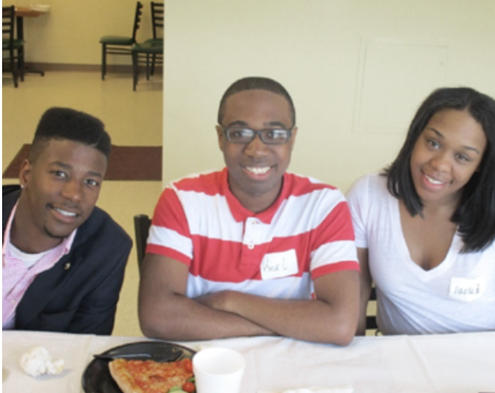
College-aged Alumni enjoying lunch

B.E.S.T. Alumni from the classes 2012-2015 kicked off summer 2016 by joining us for lunch at Pepe's to share stories about their college experiences thus far. We were so proud to hear of their summer plans, which included: working at their member school alma mater, interning at Travelers Insurance in Maryland through B.E.S.T. 's partnership with INROADS, interning at LabCorp in New York, and interning in the fashion industry in Louisiana.