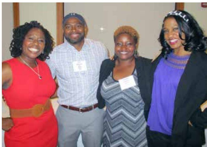
Current Parent Panel Representing: Boys' Latin School, Friends School of Baltimore, Maryvale Preparatory School, McDonogh School, The Park School of Baltimore and St. Paul's School