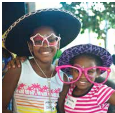
B.E.S.T. students enjoying the photo booth props