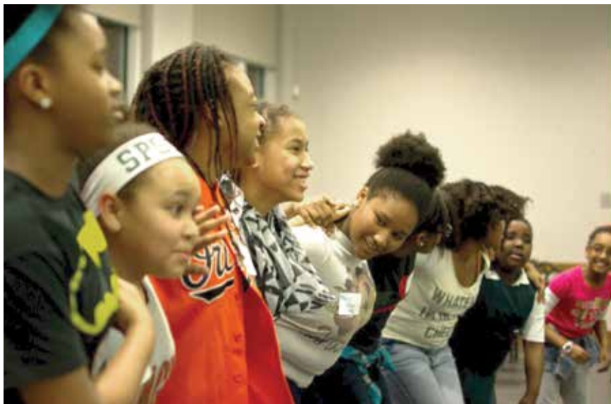
Middle School girls on the dance floor