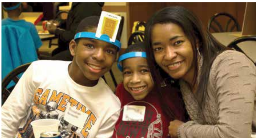
Student from Boys' Latin School with his brother and mom playing the "Headbanz" game