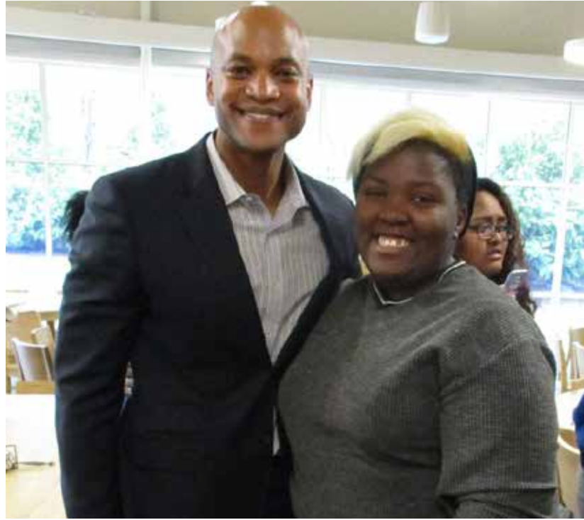
Wes Moore and B.E.S.T. senior from Friends School of Baltimore