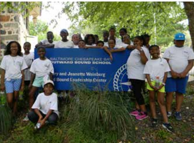
Summer Scholars students at the Baltimore Chesapeake Bay Outward Bound School