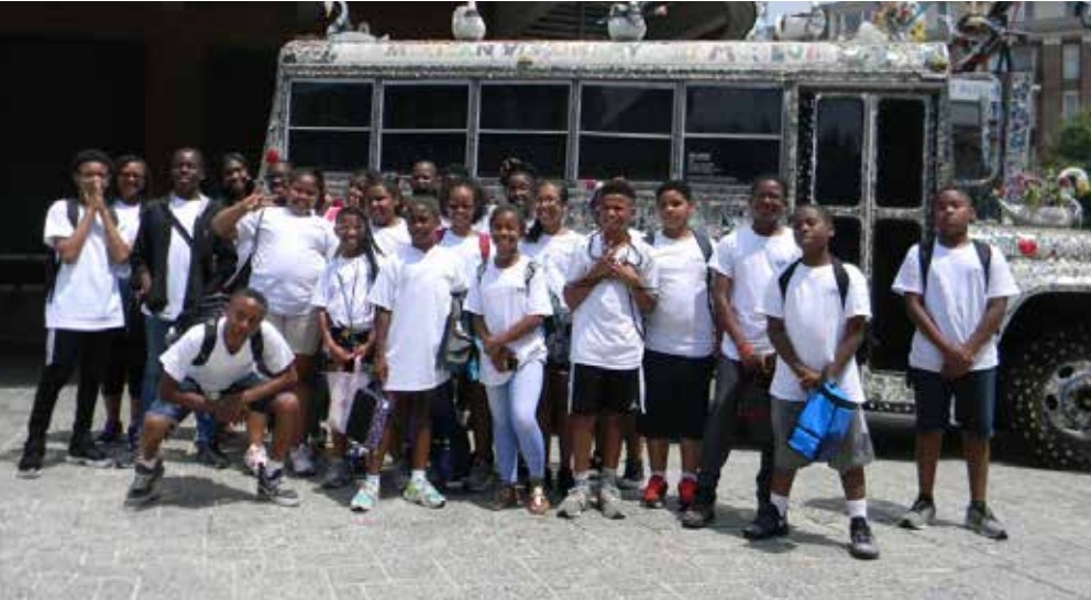
Summer Scholars students visit the American Visionary Arts Museum

For five weeks this June and July, B.E.S.T. hosted our annual academic enrichment and transition program for newly-enrolled rising middle and upper school B.E.S.T. students. The program consisted of rigorous academics, art, athletics, a curriculum focused on transitions, four field trips, and time to build lifelong friendships.