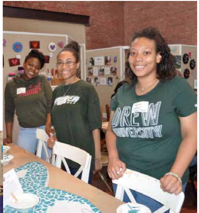
B.E.S.T. Alumni at Art With A Heart