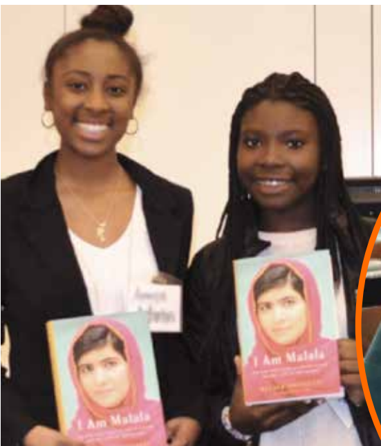
B.E.S.T. students who won the I Am Malala book raffle