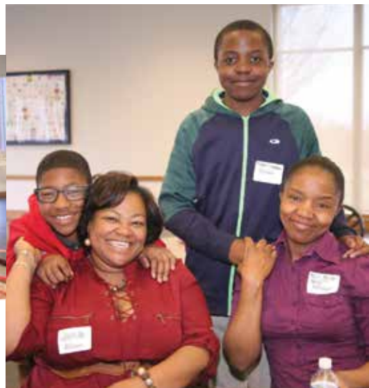
Two Middle Schoolers with their moms