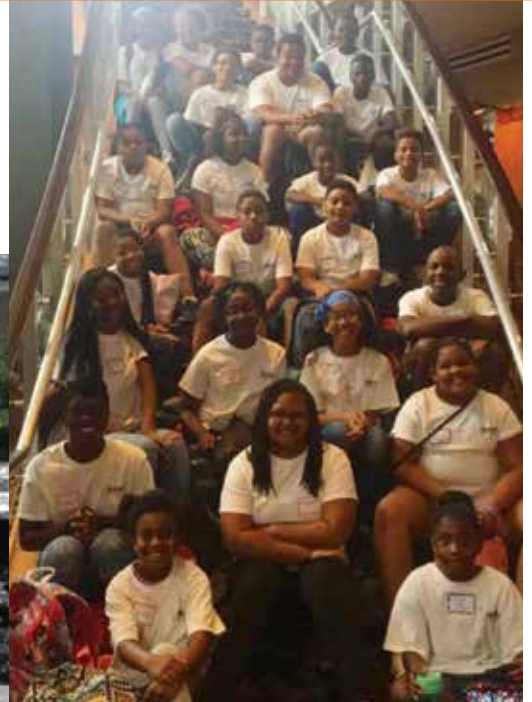
Summer Scholars students at the Hippodrome Theater