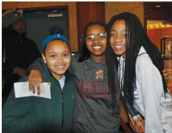
B.E.S.T. Girls at The Senator Theatre