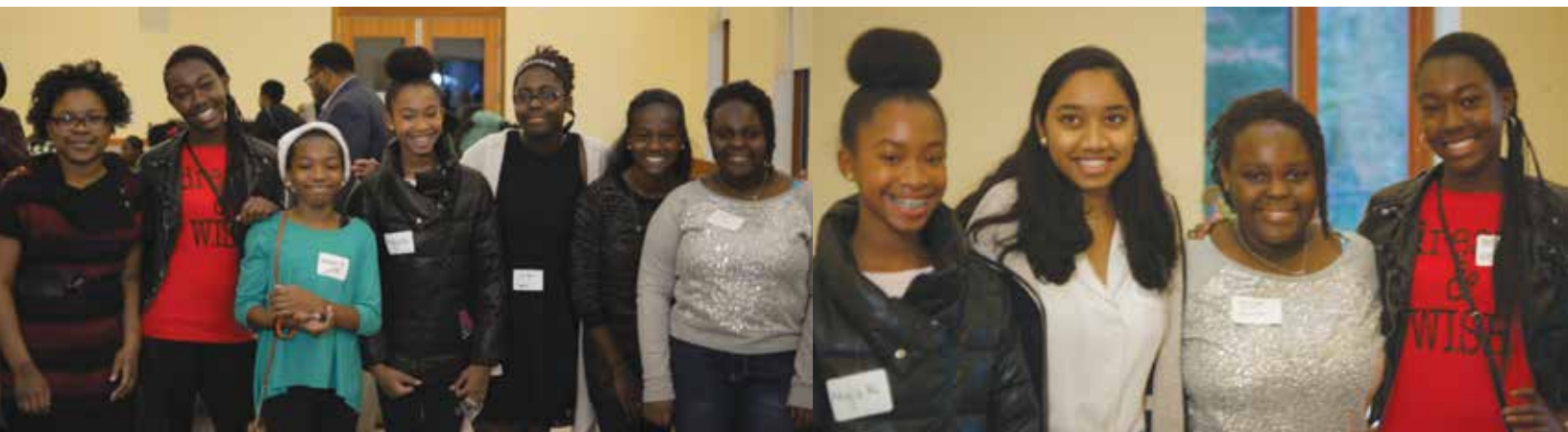
B.E.S.T. Upper School Girls