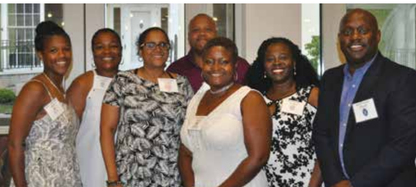
Current Parent Panel Representing: The Boys' Latin School, Calvert School, Friends School of Baltimore, Maryvale Preparatory School, McDonogh School, and St. Paul's School