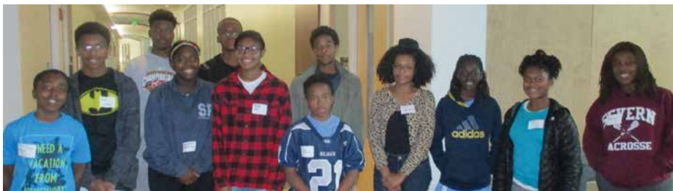
B.E.S.T. Students at the “Starting the College Conversation” Workshop

We are very grateful to Towson University and Baltimore City Public Schools for their continued partnership in hosting this meaningful workshop for students and families in Baltimore.