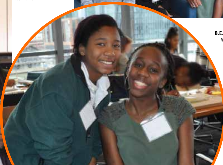
B.E.S.T. Students making their Vision Boards