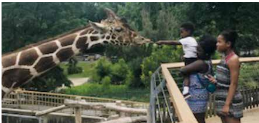
B.E.S.T. Family feeds a giraffe at the Zoo