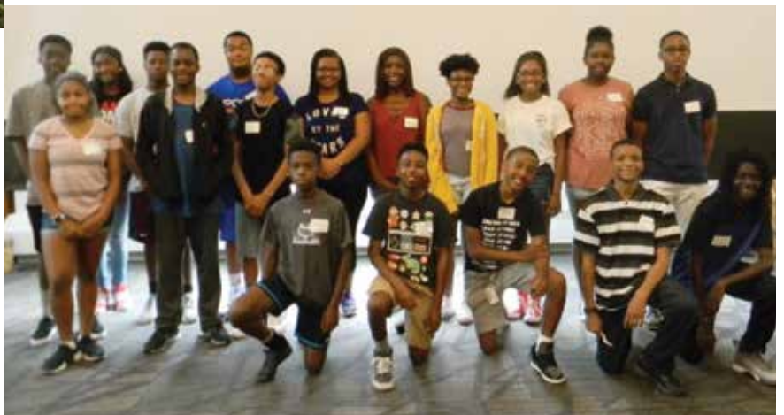
9 th Grade B.E.S.T. students at Summer Scholars Workshop Day