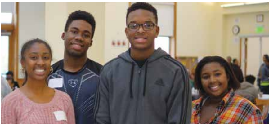
B.E.S.T. Upper School Students