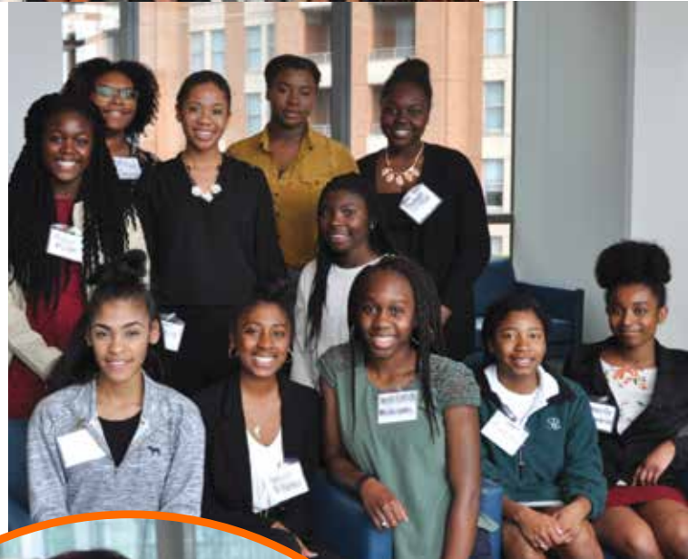
B.E.S.T. Upper School Young Women at Legg Mason

Before lunch, the young women participated in four speed mentoring sessions and then heard from the Community Law in Action organization. During lunch, the girls joined a large group of Legg Mason employees to watch He Named Me Malala . They ended the day by making Vision Boards to take with them to inspire their life's journeys. It was an incredible day for all involved. The students made meaningful connections with many of the Women's Leadership Network members.