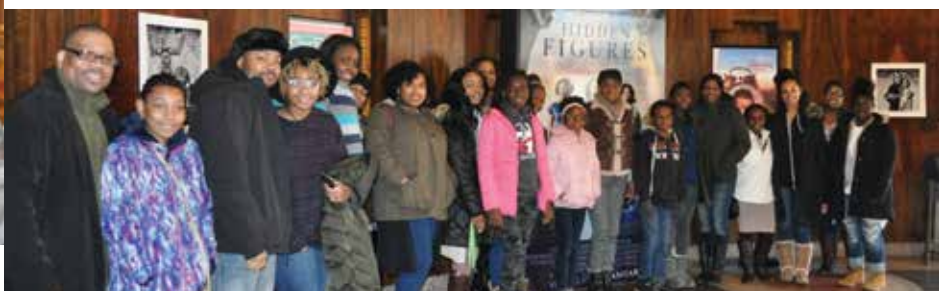
B.E.S.T. Families at Hidden Figures