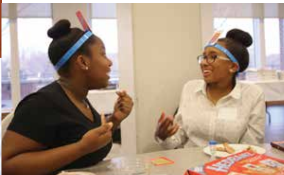
Playing the game, "Headbanz"