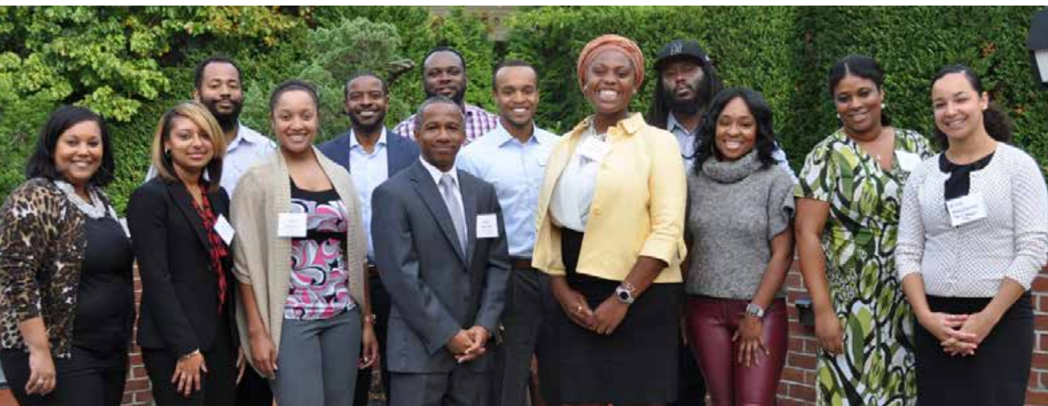
B.E.S.T. Alumni at Donna's Cross Keys

After hearing from B.E.S.T. staff about the extensive programmatic growth of B.E.S.T. since their time as B.E.S.T. students, the alums shared their current career choices and ways in which they would like to support both B.E.S.T and their member schools.